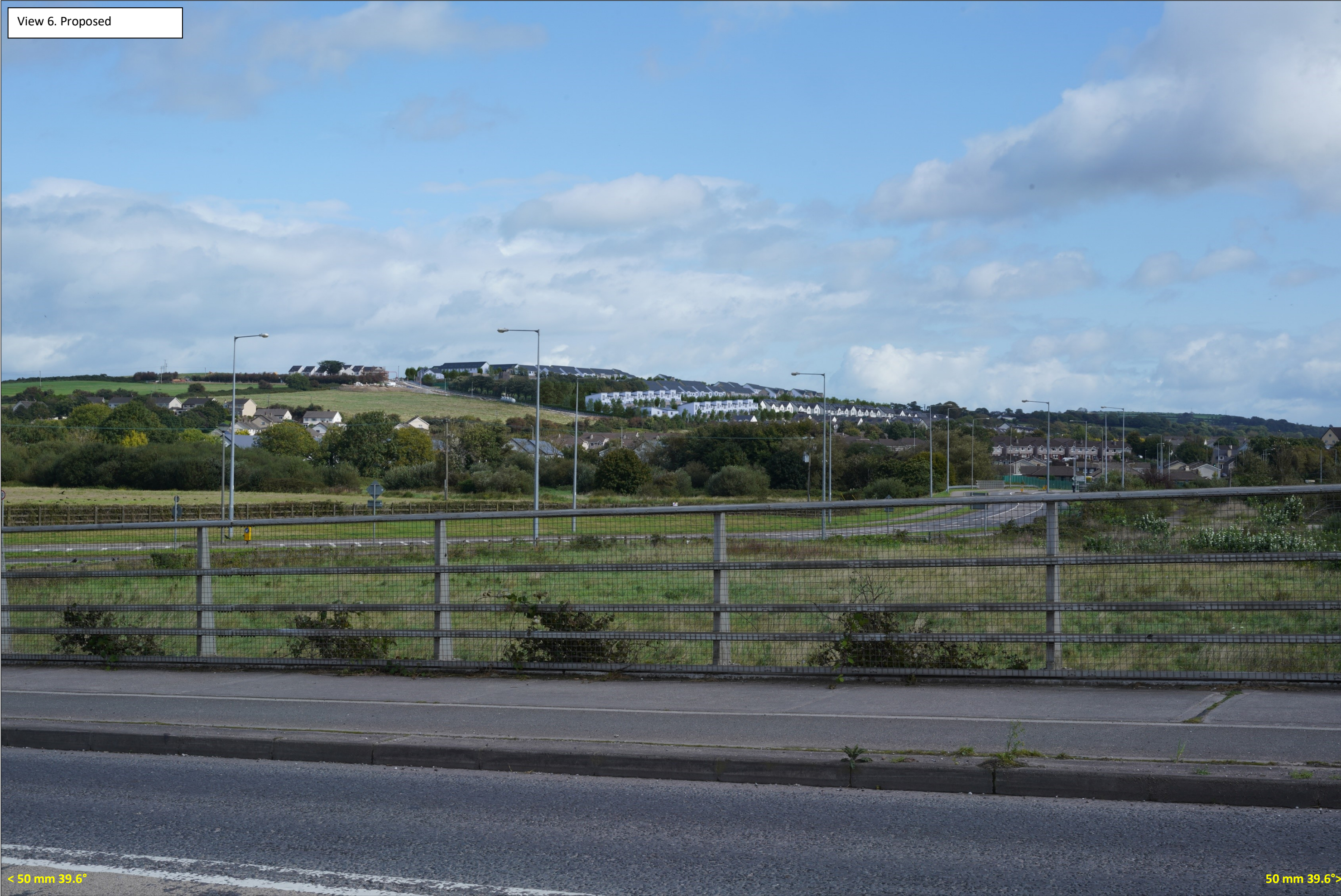
View 6. Proposed