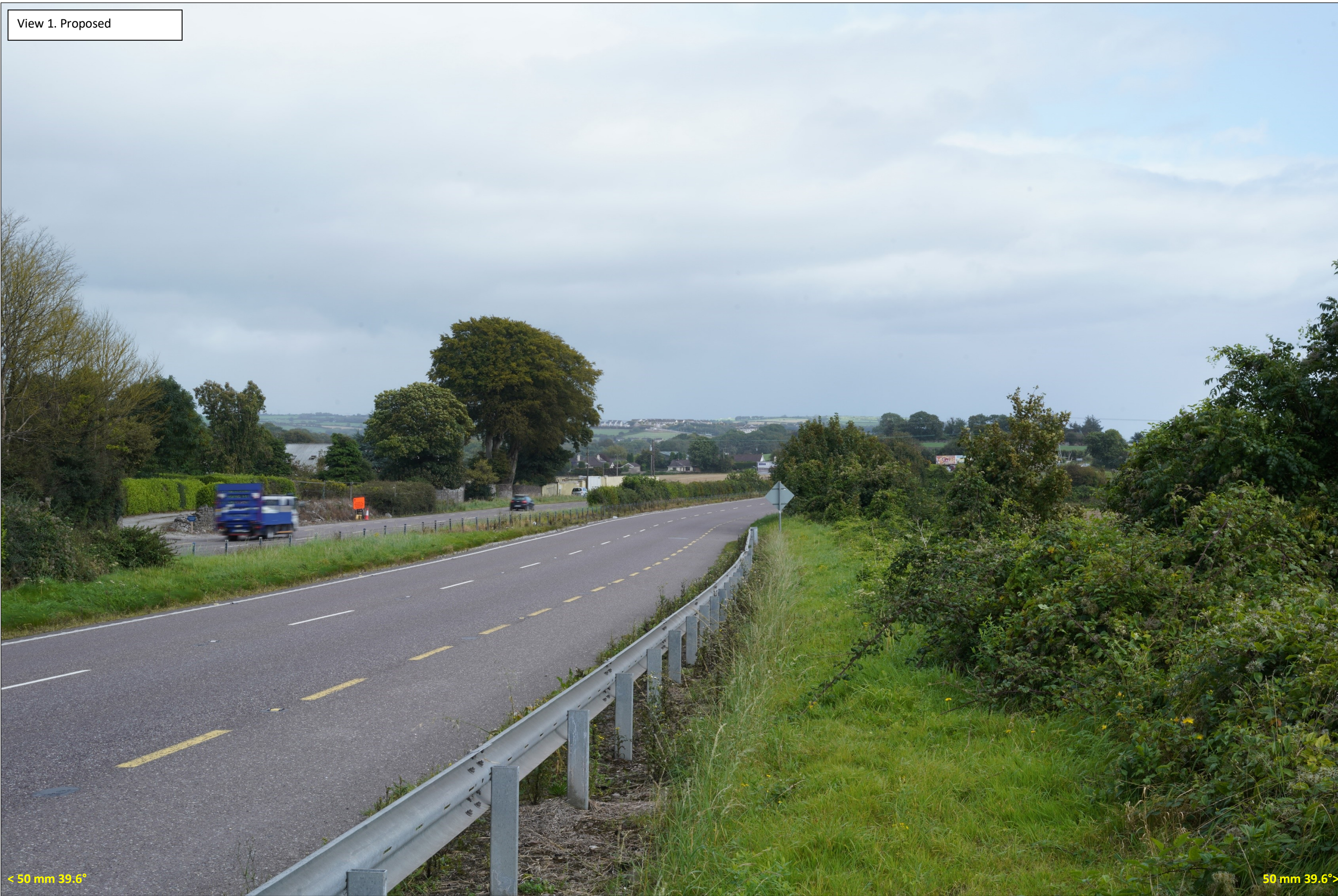
View 1. Proposed