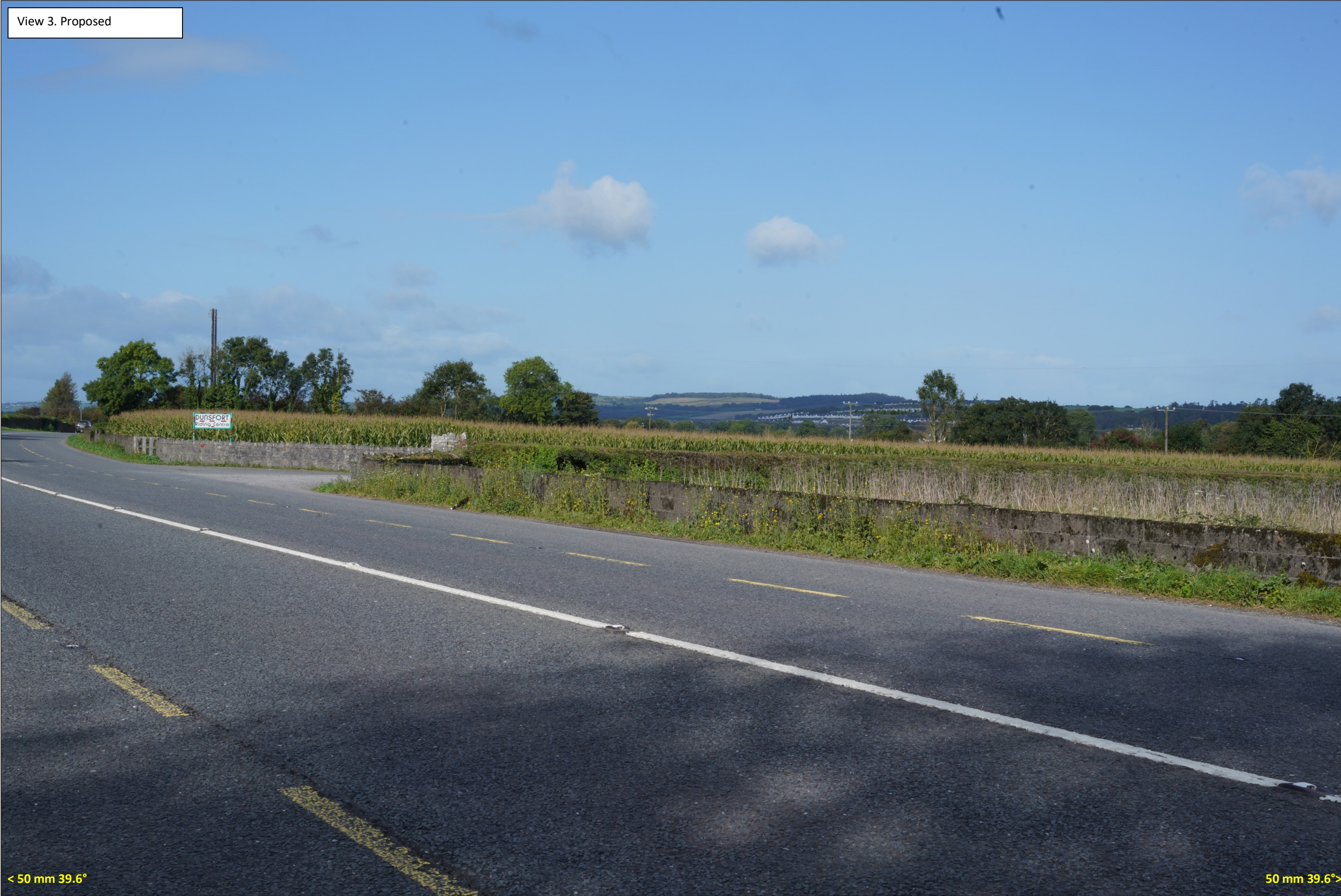
View 3. Proposed