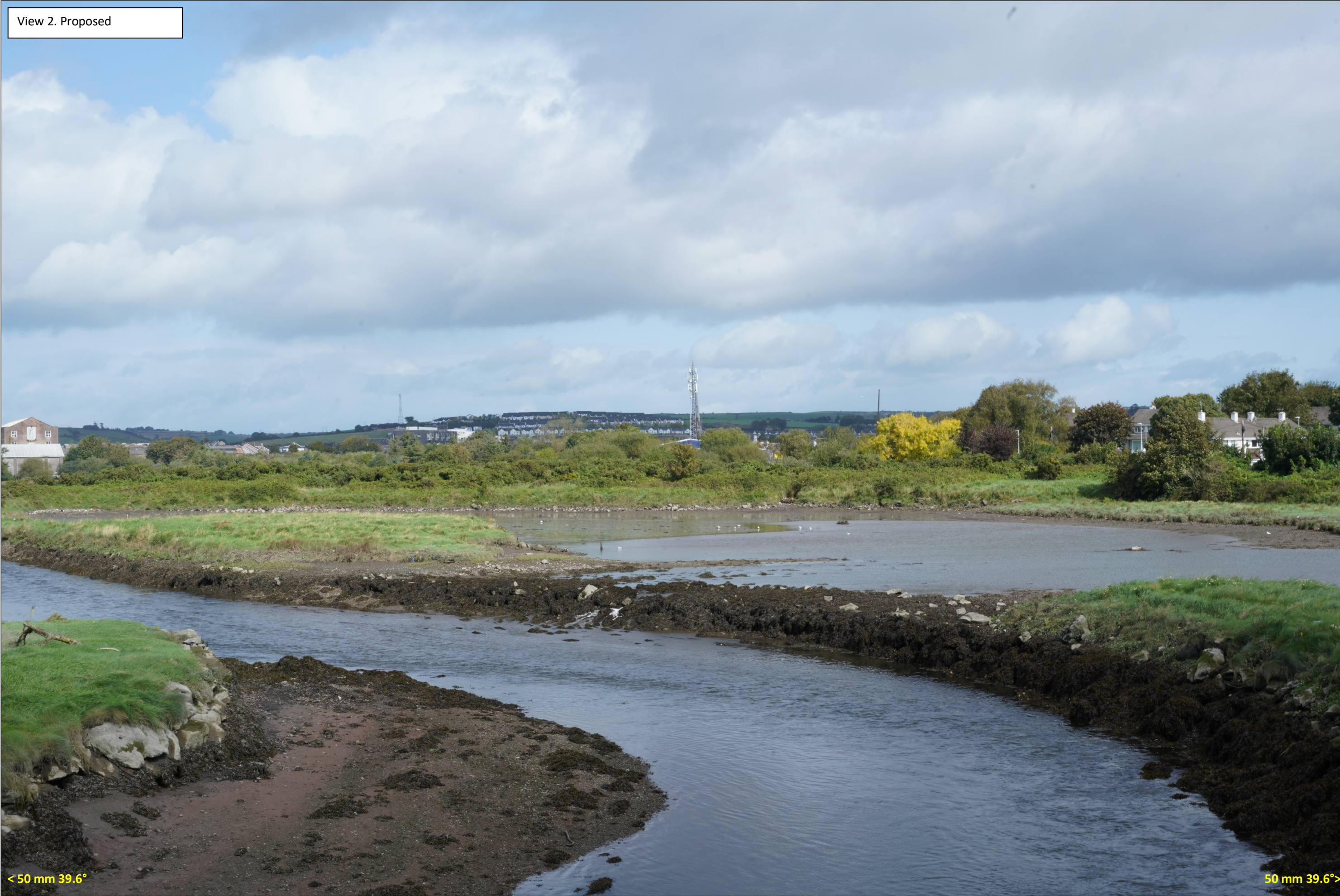
View 2. Proposed