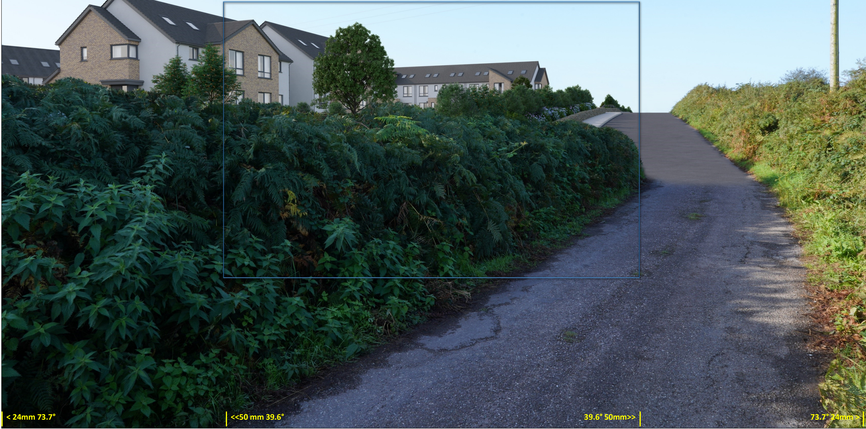
View 8. Proposed

< 24mm 73.7° <<50 mm 39.6° 39.6° 50mm>> 73.7° 24mm >