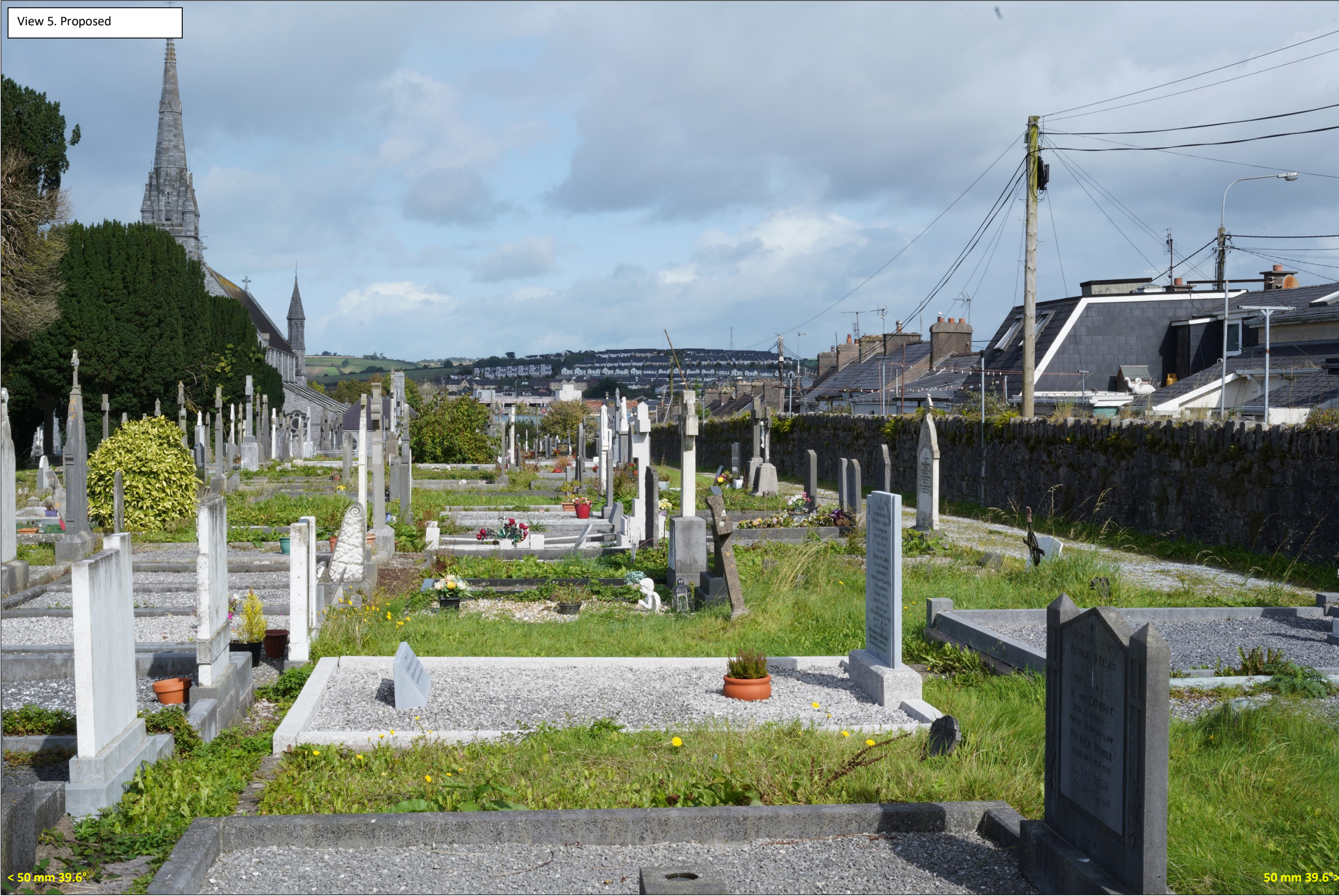
View 5. Proposed

Project Name: Broomfield, Midleton, Co. Cork