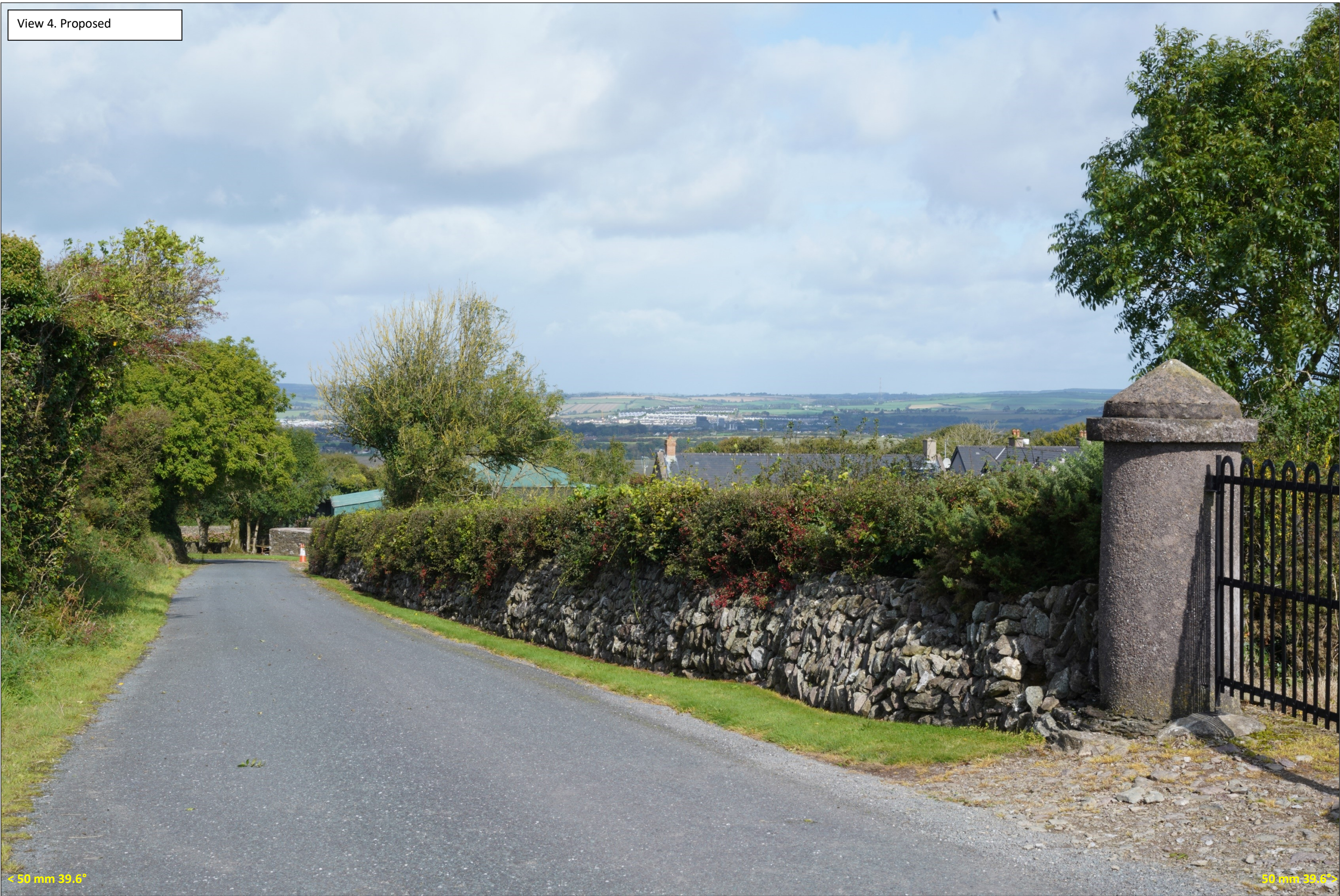
View 4. Proposed