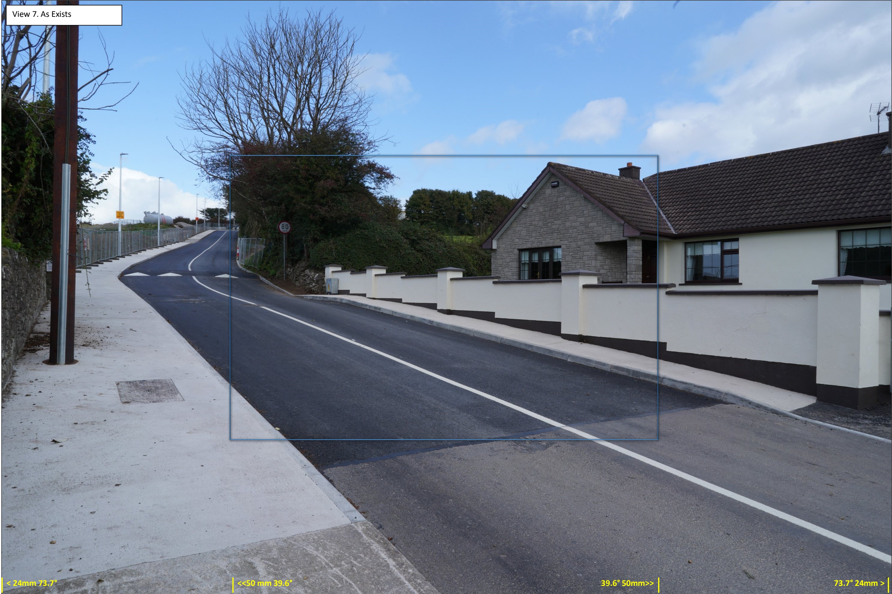
View 7. As Exists